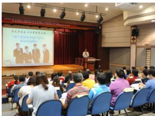
蕭前副總統萬長擔任「國貿經營策略管理將帥班」講座 Former Vice President Mr. Vincent Siew lectures at ITBS CEO class