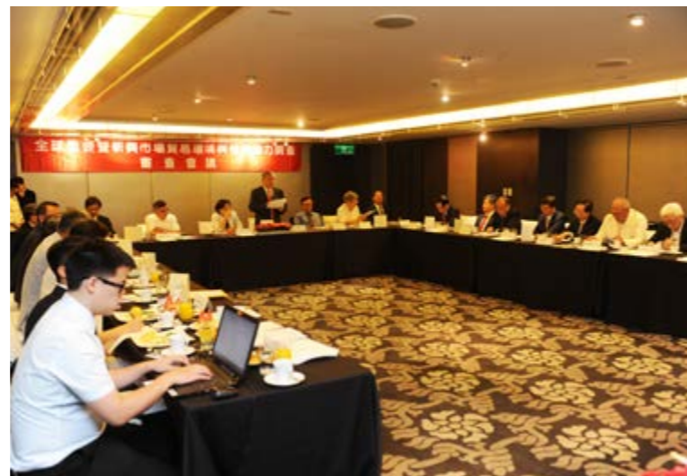
辦理全球重要暨新興市場貿易環境與發展潛力調查計畫 Investment Environment and Risk Survey