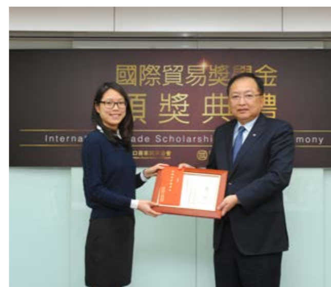
頒發國際貿易獎學金 International Trade Scholarships