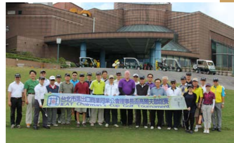
舉辦會員高爾夫球敘活動 Regular golf games promote social interaction among members