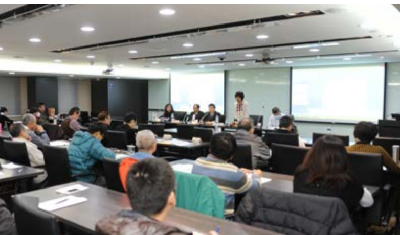
召開行業小組會議 Meeting of the industry-specific working groups