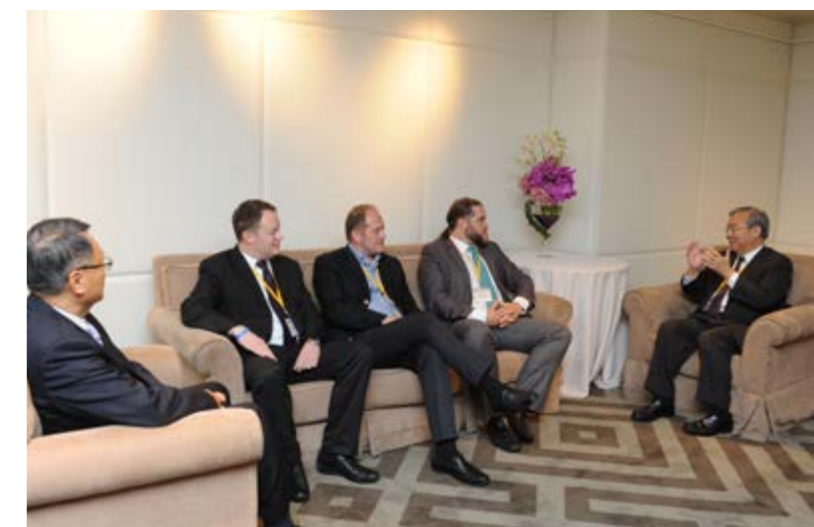
拓展國際經貿關係 IEAT fosters close business relations with global partners

The Trade Promotion Department consists of the International Affairs Section and the Mainland China Affairs Section; the Trade Services Department oversees the Domestic Affairs Section and the International Trade Business School; and the Administrative Services Department manages the Finance and Administration Section, and General Affairs Section. The IEAT is also commissioned by the Bureau of Foreign Trade to run the Exhibition Supporting Project Office, MOEA (ESPO) and the Global Trade Pioneer Project Office, MOEA.