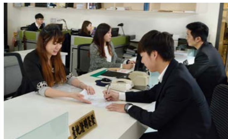
簽發原產地證明文件 Certificate of Origin issuance