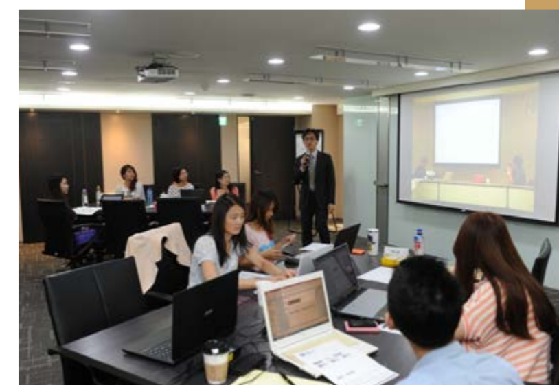
舉辦各類貿易講習班 Training of trade expertise