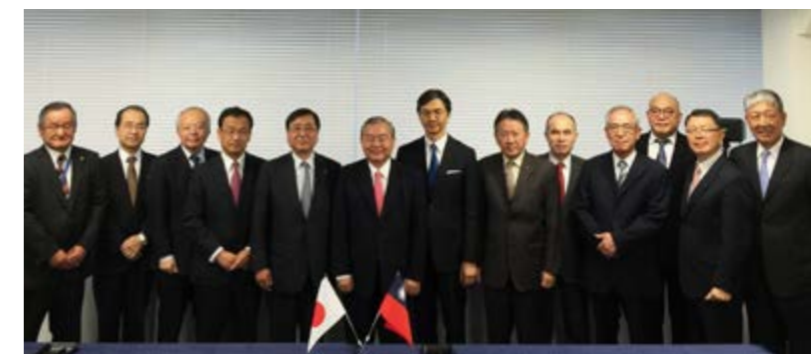
與東京商工會議所簽署合作協議書 IEAT and the Tokyo Chamber of Commerce and Industry sign a cooperation agreement

The IEAT is committed to providing quality service catering to members' needs. In consecutive years, the IEAT has received service excellence awards by the Ministry of Economic Affairs (MOEA), the Mainland Affairs Council, and the Taipei City Government. The association also engages in charity work, community service, and services to national servicemen and their family members.