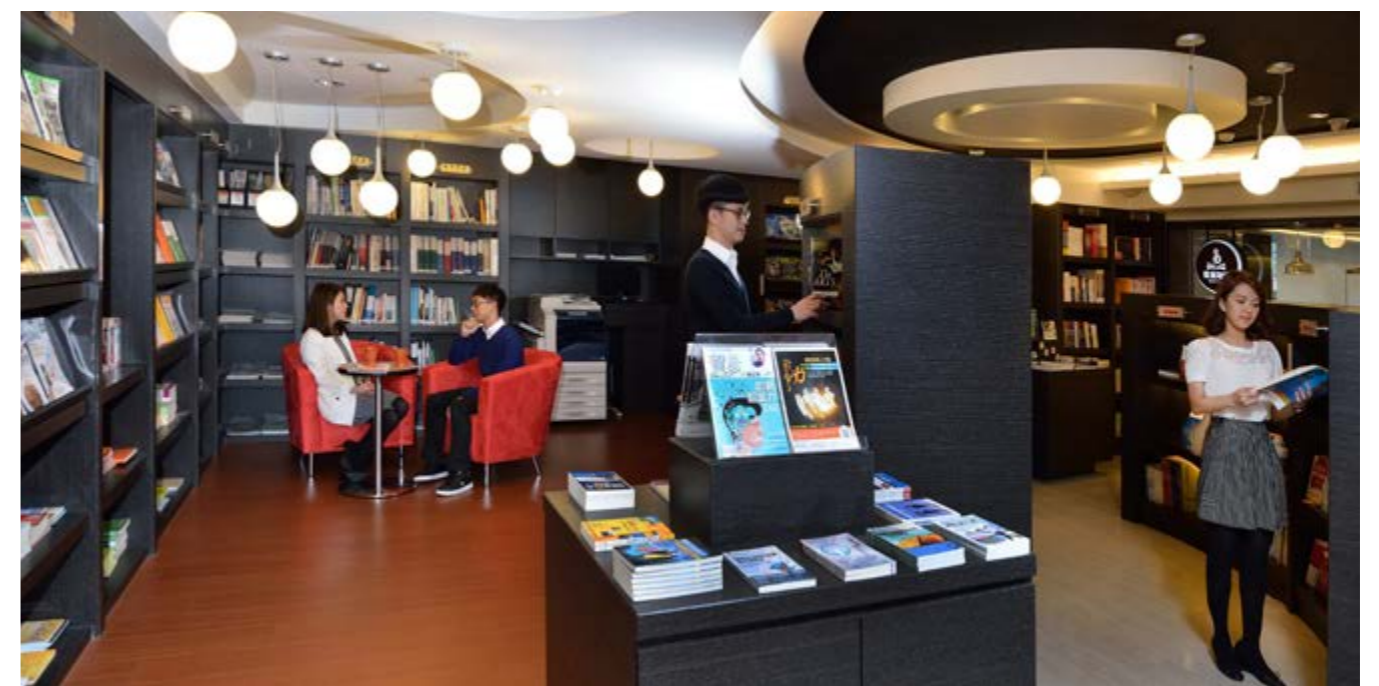
公會書廊 The Book Gallery and the Trade Resource Library