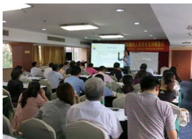
舉辦「國際酒類產品貿易推廣會」 International Wine Promotion