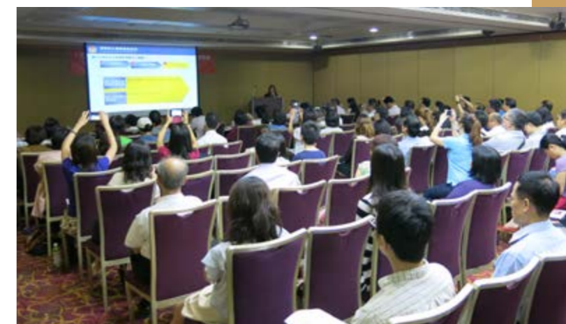
舉辦「台灣健康產業大陸市場廠商聯誼會」研討會 The Taiwan Health Industry China Business Development Association hosts a business seminar