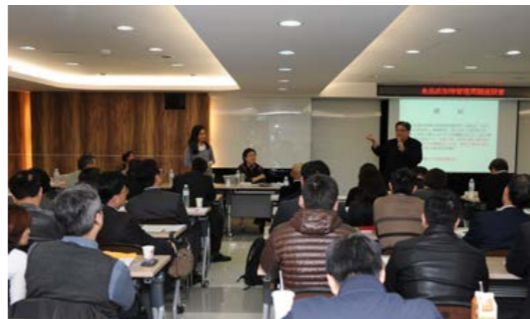
向主管機關提出建言 Making recommendations to government agencies