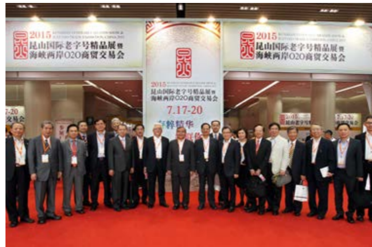
自辦國際展會，創造商機 IEAT organizes international trade fairs to create trade opportunities