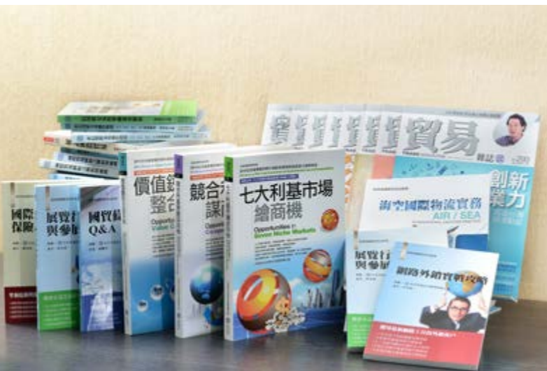
出版《貿易雜誌》與經貿叢書 The Trade Magazine and trade-related publications