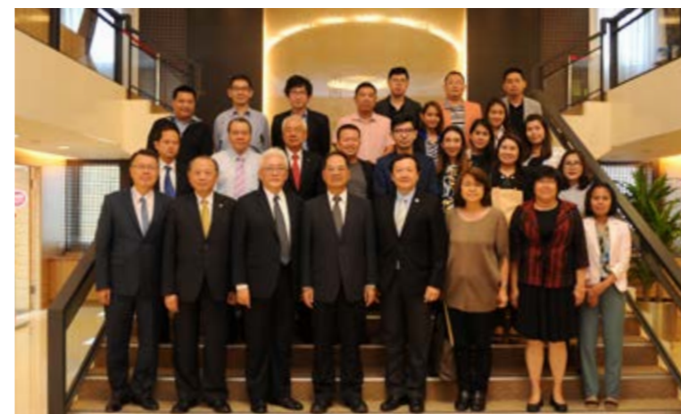
接待泰國商業總會訪問團 The Thai Chamber of Commerce pays a courtesy visit to IEAT