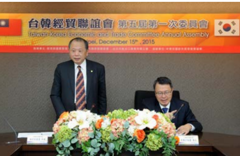
召開台韓經貿聯誼會委員會會議 The Taiwan-Korea Economic and Trade Committee convenes a regular meeting