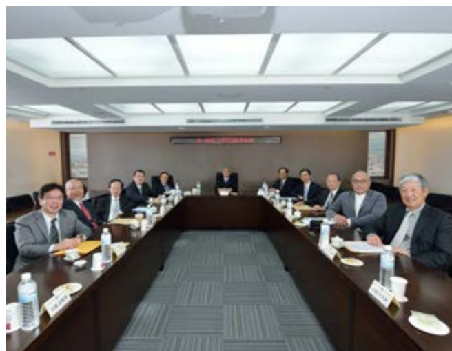
召開理監事聯席會議 Joint meeting between Boards of Directors and Supervisors