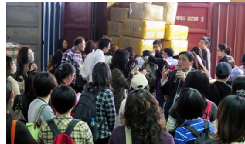
舉辦海關參觀活動 Member companies visit the customs department for a better understanding of its operations.