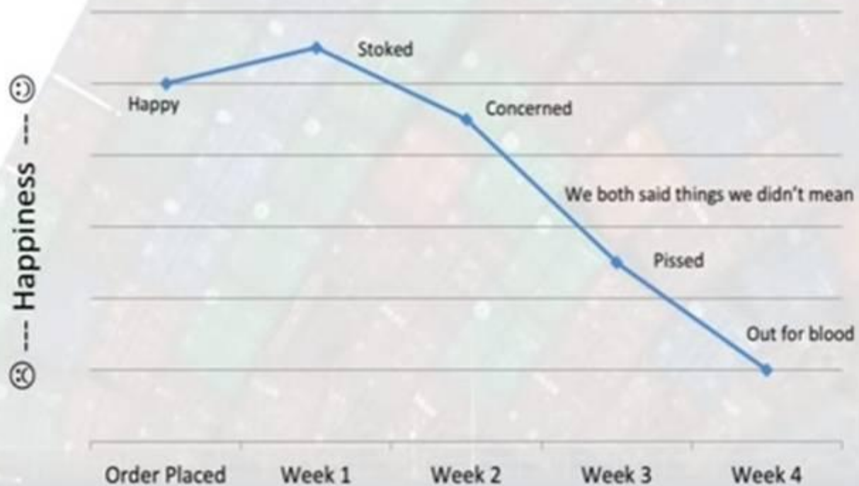
Customer Happiness/Patience Over Time